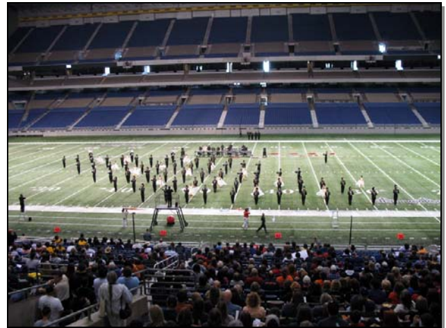
The Galena Park High School Band performed at the UIL State Marching Contest in San Antonio, TX