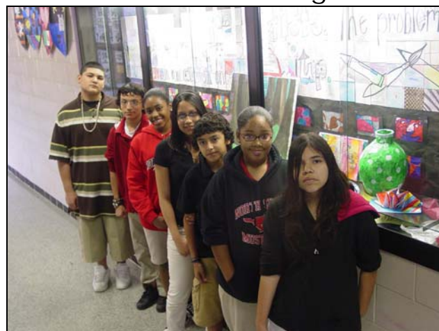
NSMS art students earn awards in two recent contests

North Shore Middle School art students participated in the 35th Annual Fire Prevention Poster Contest sponsored by the Houston Fire Museum, in cooperation with the Houston Fire Department and the Independent Insurance Agents of Houston.