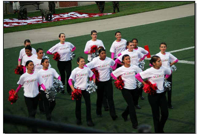
Senior members of the North Shore Senior High School Scarlets drill team after performing Victory Line at the September 11 football game.