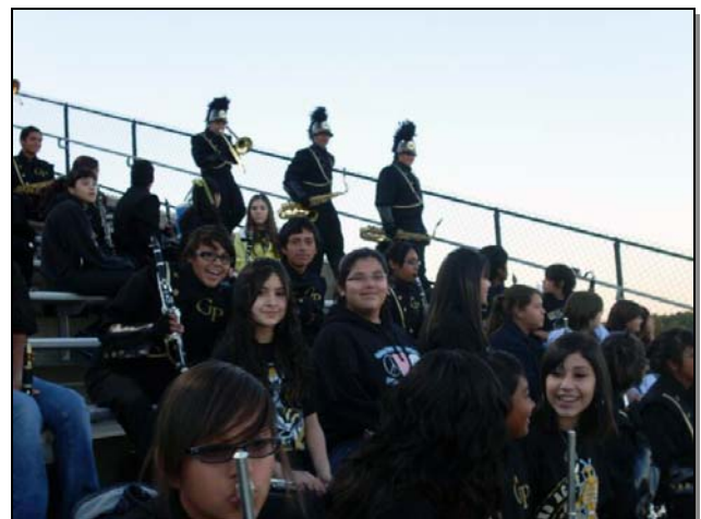
Students from Galena Park and Woodland Acres Middle Schools joined the GPHS "Band of Gold" for their annual Middle School Band Night on October 23