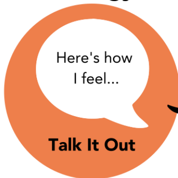
Talk It Out