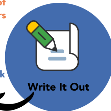
Write It Out