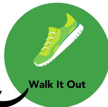
Walk It Out